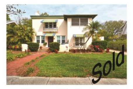
Crescent Lake Area