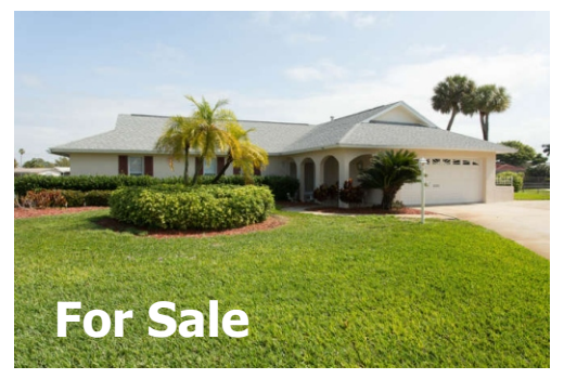
4400 38th Street S - Offered for $550,000 3 Bedrooms / 2 Baths - 2,036 sq ft - Pool Pie-shaped lot with roughly 200 feet of waterfront!