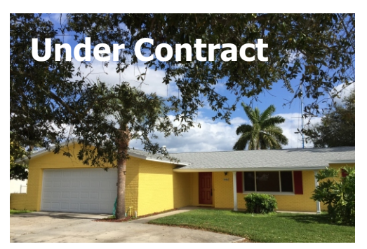
4460 38th Street S - Offered for $479,000 3 Bedrooms / 2 Baths - 2,136 sq ft Awesome kitchen. Mooring for up to 70' sailboats.